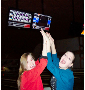
Annual Candlelight Bowl