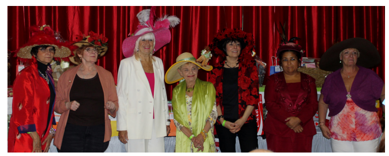
Salvino Derby Day