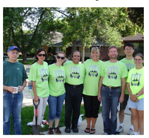
Concordia College Professors