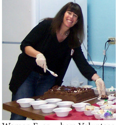
Women Everywhere Volunteer