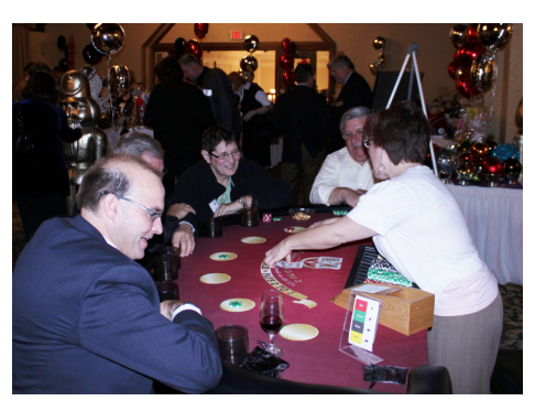
Annual Benefit Volunteers