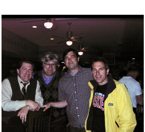
Fuego Loco Fundraiser