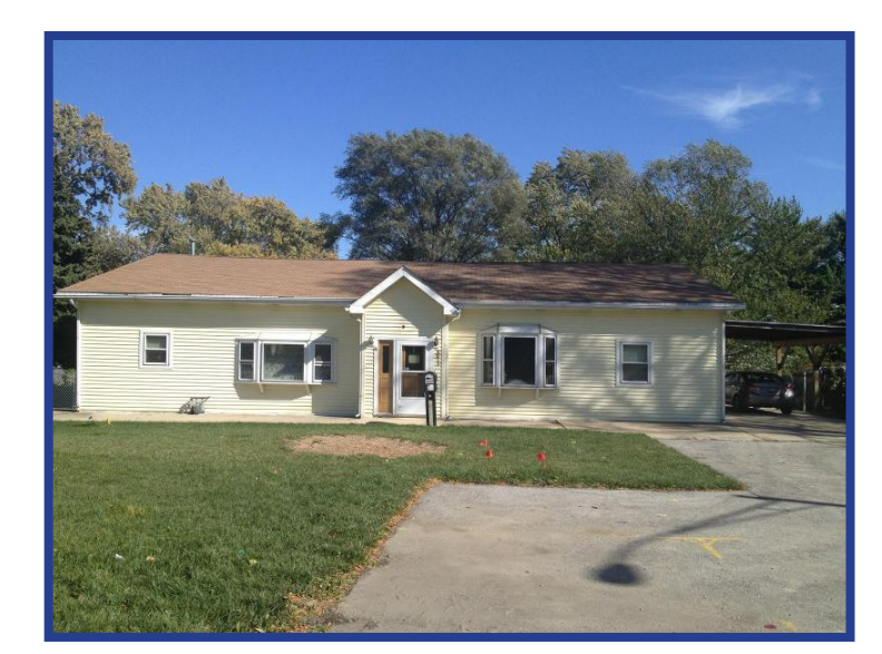
The Wolf Road CILA (Community Integrated Living Arrangement) opened its doors in 2013.

Oak-Leyden's main office building and Children's Services' Center received a new facade. The building located at 411 Chicago Avenue in Oak Park looks like a new building with its decorative lighting, new signage and curb appeal.