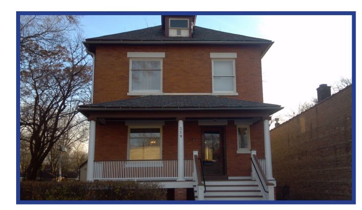
The front porch at our Chicago Avenue CILA in Oak Park was remolded and restored to highlight the home's beautiful historical character.