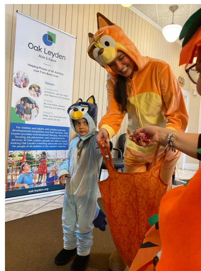
We of course celebrated Halloween! Our Children's Services team hosted many