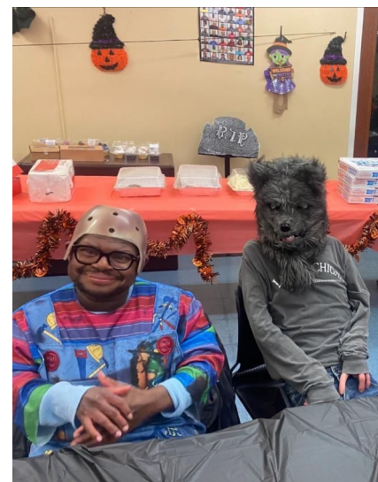
Our CILA residents gathered in one of our Lifelong Learning centers to