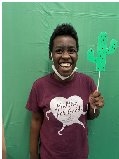
Fun and Relaxation: Our Lifelong Learning day program participants